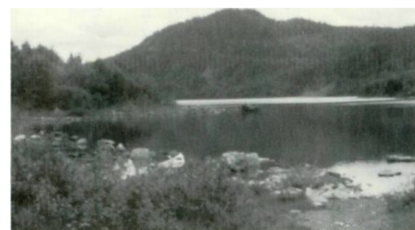
Deboullie has low rugged mountains and small scenic ponds.

Hiking Visitors can enjoy an extensive network of hiking trails leading to many remote ponds. Deboullie Mountain is also a popular destination for hikers: its inactive fire tower offers expansive views of the area. In thick woods the alert hiker may spot one of the area's locally famous "ice caves"- actually deep, narrow crevices in the rocks where ice remains into late summer or throughout the year, depending on the weather.